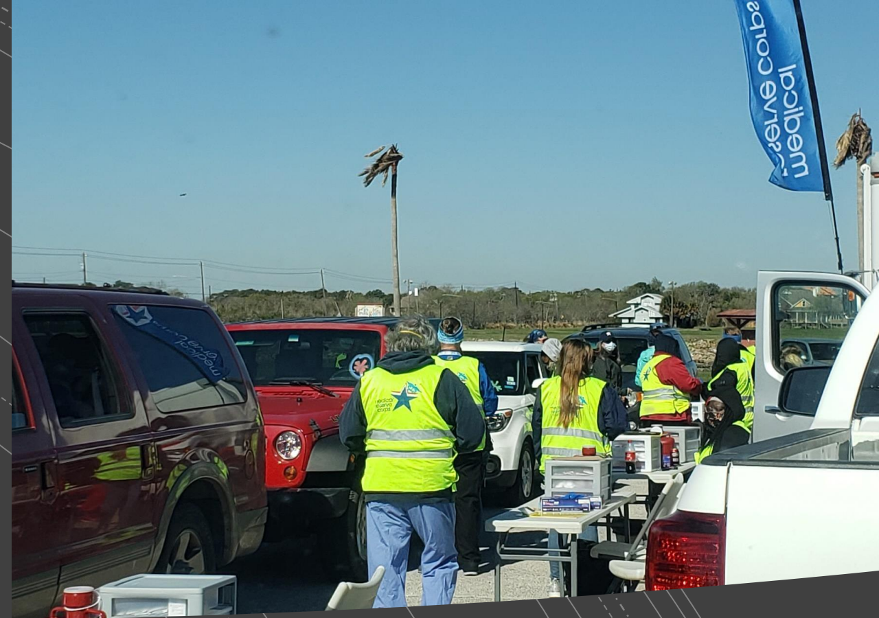
GCMRC in action at drive thru COVID-19 Vaccination clinic.